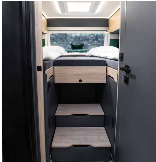
Access to the extended single beds is made even easier thanks to a newly developed step system with rails.