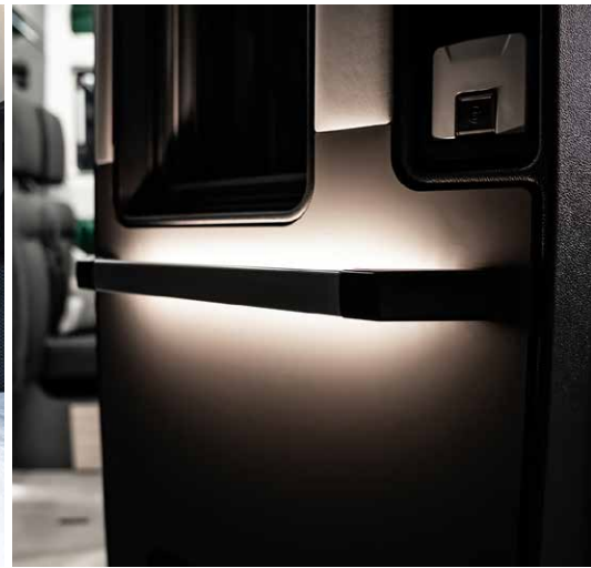
Smart features: illuminated handle in the new body door as well as Coming-Home and Leaving-Home functions.