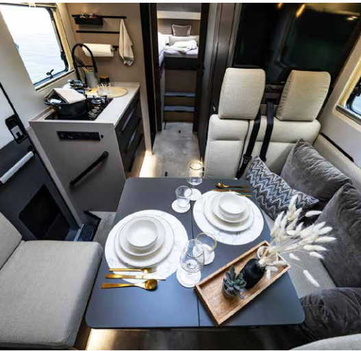
The large seating area is available either in cream with the style color Dune or in anthracite with the style color Forest.