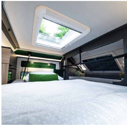
Perfect for families: the longitudinal beds are complemented by an electric drop-down bed that completely "disappears" into the ceiling.