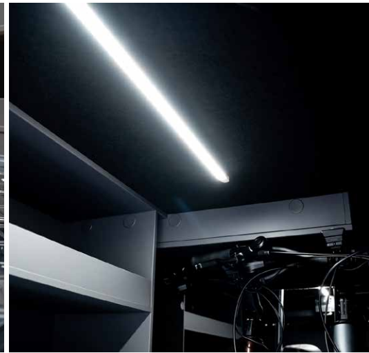
The bright lighting in the rear garage makes loading and unloading especially easy, both day and night.

» "Next level comfort' is one of the most important themes of the FRANKIA NOCTRA. Whether it's the feeling of space, storage, or lighting – from the big picture down to the smallest detail, we have reimagined solutions to make travel as comfortable as possible. A particular highlight of comfort is certainly the completely redesigned double-floor concept with an enormous pass-through compartment and pull-outs. Travelers also benefit from the new hatch concept, which allows individual accesses to be opened effortlessly with a simple touch. Existing handles are recessed and can be opened single-handedly. All this, and much more, stands for the next level of comfort that defines FRANKIA's future."